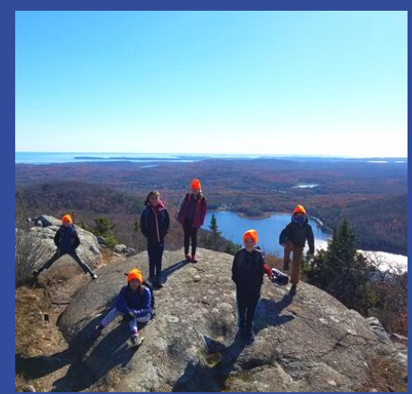
BEST of the MDCOAST: rising 5th & 7th graders