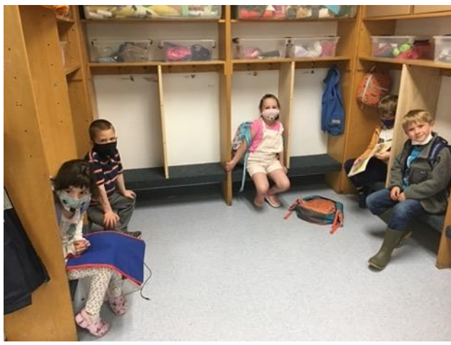
Kindergarten students reading to each other at the end of the day.