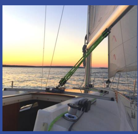
SALINGEXPEDITION rising 9th graders