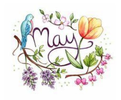
HES MENU 5-24 through 5-28

Monday (5/24): Smoothies (Breakfast) Egg Salad Sandwich (Lunch)