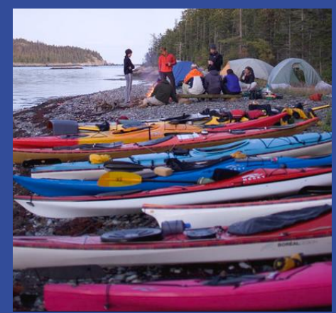
SEAKAYAKINGEXPEDITION rising 8th-10th graders